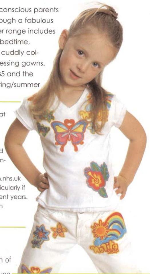
Stylish outfits from: www.lestroisenfants.com

This cute flowered T-shirt costs from £35 and the trousers are from £50. Browse the full spring/summer range on www.lestroisenfants.com